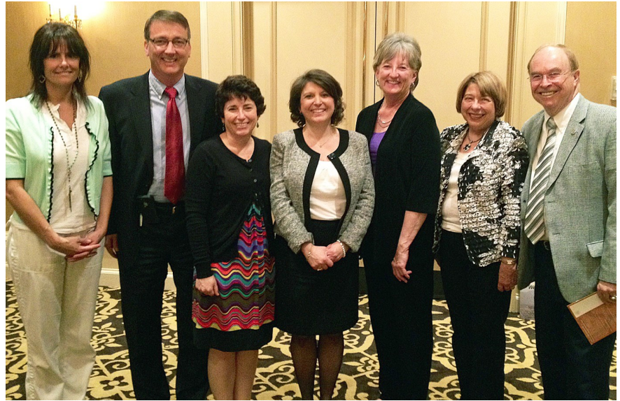
LCS Education Foundaion Trustees receiving GLCT Youth Philanthropy Grant in April 2015 (above.) Warehouse shopping day in March, including Kohl's stuffed animal give-a-way (below.)

Financial gifts and school & office supply donations are encouraged and include (but are not limited to): 3-ring binders, backpacks, colored pencils, crayons, dry erase markers, erasers, glue, headphones, highlighters, index cards, markers, pencils, pencil cases, scissors, spiral notebooks, tape, two pocket folders, and ruled notebook paper. Please contact our director if you can help!