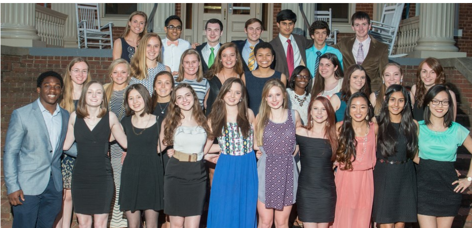
The top fifteen academic (GPA) graduates from both E.C. Glass and Heritage High Schools were honored at a special recognition dinner held at Randolph College on May 3, 2015.