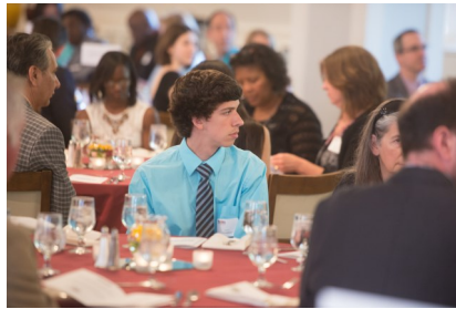
Students, family guests, and special teachers attended (above) and each student was presented with a certificate of achievement (below).